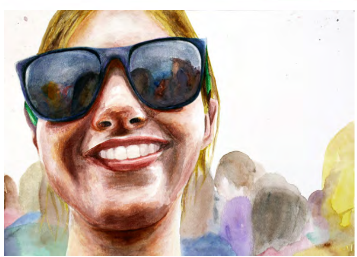
Self Portrait, Watercolor

An important facet of NYSATA's mission is to support students who wish to pursue higher education in the visual arts. NYSATA currently awards the following five scholarships each year.