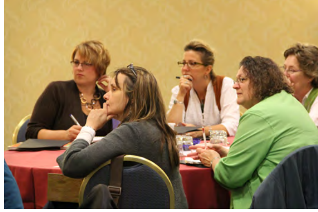
Looking at Creativity with The Guggenheim