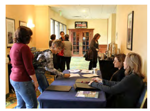
Our thanks to everyone who help make this annual conference a reality!