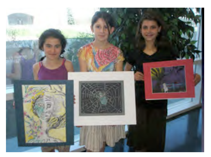
Students display their work from the 2011 Region 7 Portfolio Project Adjudication

The NYSATA Portfolio Project is an authentic assessment based on the work your students are already doing in your classroom. If you have never participated, make this the year that you do! It is a learning experience, an assessment instrument, and a powerful advocacy opportunity!