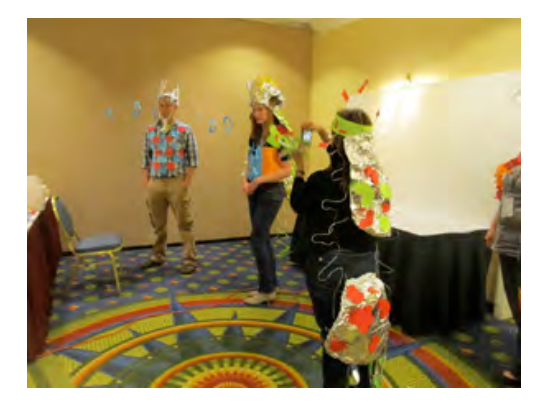
Over 85 workshops were offered this year! They included current pedagogy, best practice, handson media exploration, extended studio experiences, and a variety of technology and social media related workshops.